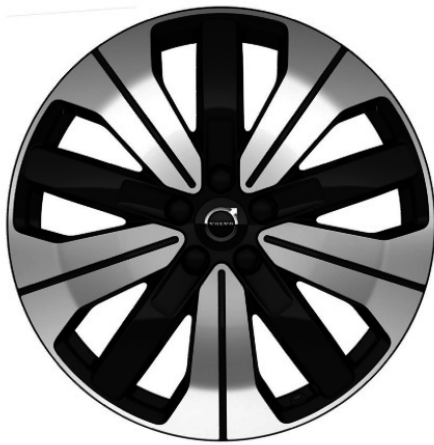
19" 5 Spoke (std Core and Plus)