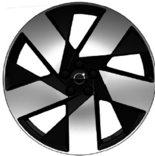
20" 5 Spoke (#1185) Std Plus C40 and Ultimate C40 and XC40